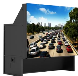
LED Light Source