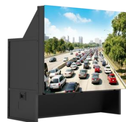
Laser Light Source